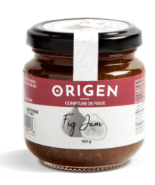
FIG JAM, 150 G

Origen Fig Jam is the perfect way to add an exclusive flavour to your cheeseboard. This spreadable superstar will take any cocktail or dinner on an easy yet delicious adventure with its subtleties of sweet notes in each bite, featuring hand-selected fresh fruit from the Region of Murcia.